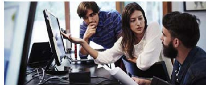
Open Source Contributor › For developers actively contributing to open source projects.

Visit us at https://software.intel.com/en-us/qualify-for-free-software