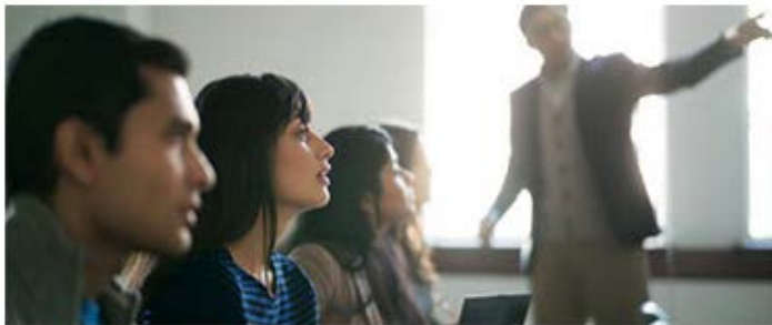
Educator › For use in teaching curriculum.