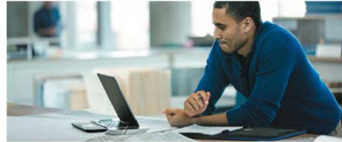
Student › For current students at degree-granting institutions.